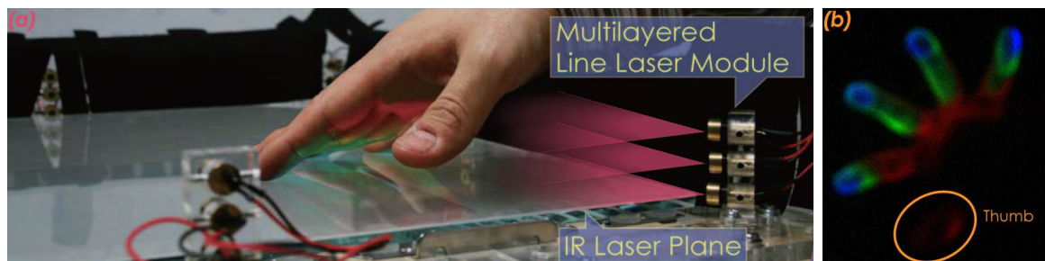
Figure 1: These two pictures have been captured simultaneously. (a): Tabletop of Z-touch. Multilayered line laser modules are placed at the edge of the tabletop panel. (b): Captured depth map of the hand near the top panel of Z-touch shown in (a). RGB channels correspond to the Laser Plane: R-Highest, G-Middle, B-Lowest (very close to the surface of the tabletop). The image at the bottom of (b) is that of the thumb not touching to the surface, so the silhouette is in a pale red color.

Jun Rekimoto The University of Tokyo Sony Computer Science Laboratory